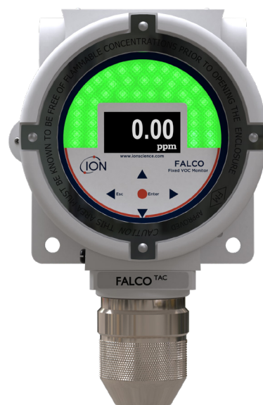
Diffused TAC (10.0eV) model