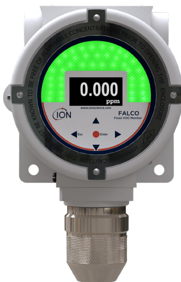
Diffused 10.6eV model

Registering your product online within one month of purchase will extend its warranty.