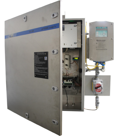
Model: A73022 Exp