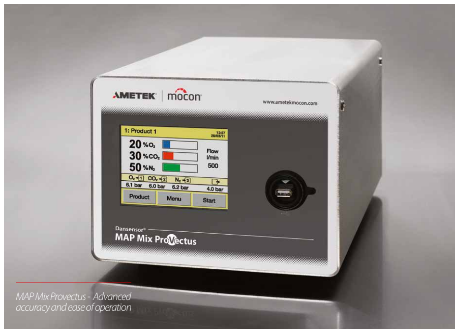
MAP Mix Provectus - Advanced accuracy and ease of operation