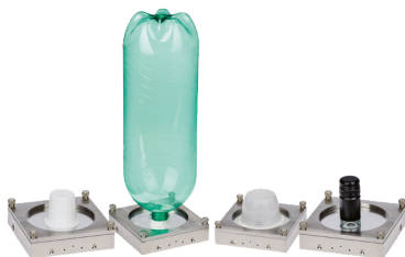
Bottles, cups, caps, and more

We offer a variety of cartridge options designed to fit a wide range of package types.