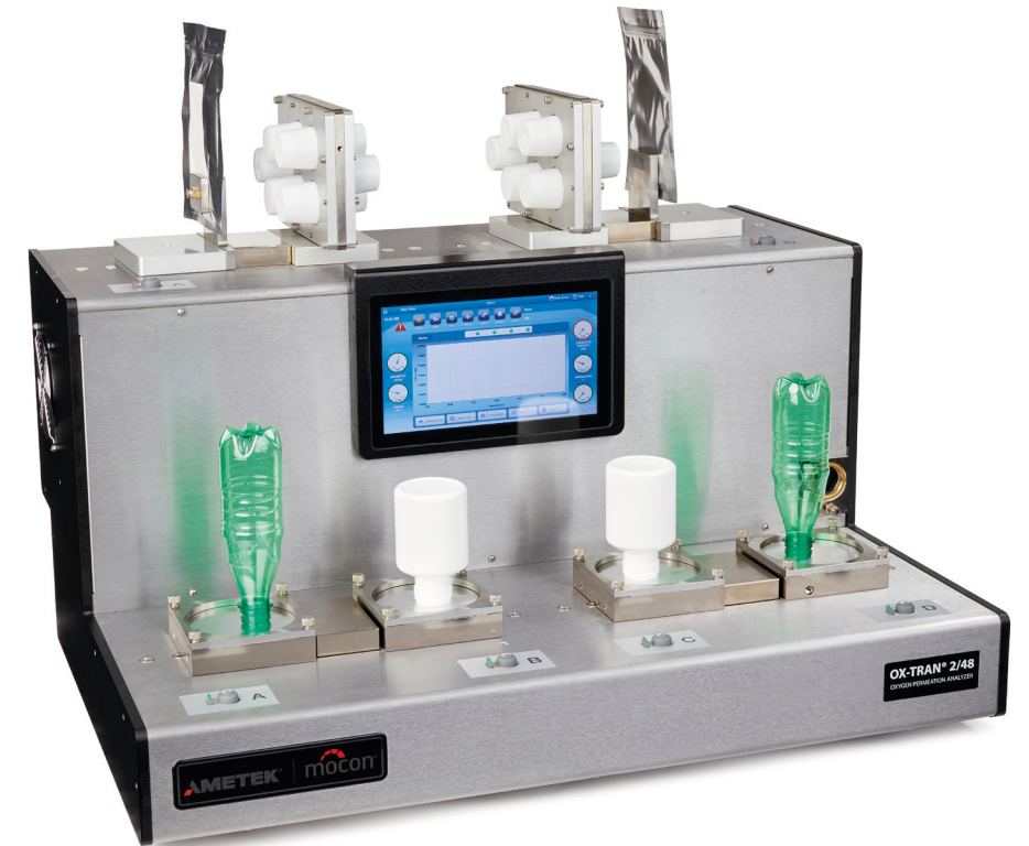
Parallel conditioning and examination capability increase instrument throughput compared to traditional series methods