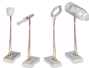
Whole packages, syringes, tubing, and more