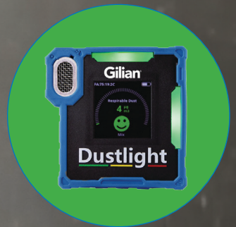
Safe Air Quality