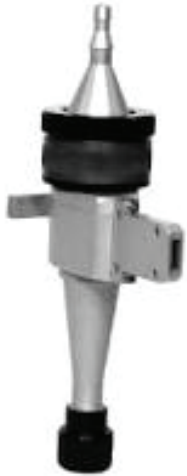
Gilian FSP-10 cyclone offers a high flow rate alternative for better sensitivity in silica sampling.

The new OSHA standard for silica dust requires larger air samples to attain improved sensitivity for lab analysis, and application of this high flow European cyclone is described in NIOSH Report ECM/2011/03 using a 37mm, 5 micron PVC filter membrane. Developed in Germany for 10 LPM sampling following Europe's 5 micron 50% particle size curve, it also conforms to the traditional US respirable dust curve (50% at 4 microns) at 11.2 LPM. The unit uses a European style 37mm filter holder, and is suggested for use with the Gilian 12 pump.