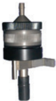
HD style cyclone with European style sampling cassette.

Identical in function to our BGI-4L Higgins-Dewell style cyclone, this Higgins-Dewell style cyclone incorporates two different styles of European filter cassettes and holders. It is ideal for respirable dust sampling according to HSE MDHS 14/3 (UK) at 2.0 LPM (50% cut at 5 microns). In that sampling method glass fiber filters and MCE filters are recommended, depending upon the application. The GilAir Plus and Gilian 5000 pump models are suggested for use with this cyclone.