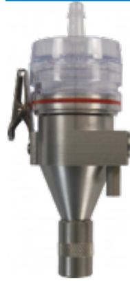
GK 2.69 Cyclone can be used for respirable or thoracic sampling.

The GK 2.69 respirable dust cyclone operates at 4.2 LPM to follow the US-ACGIH respirable dust size distribution curve with 50% cut at 4 microns. It can also be used at 1.6 LPM to follow convention for thoracic dust sampling with a 50% cut at 10 microns. It also uses 37 mm, 5 micron, PVC, 3-piece NIOSH style cassettes. An alternate version using 25mm cassettes is also available. The Gilian 12 sampling pump is recommended for respirable sampling. The GilAir Plus and Gilian 5000 pump models are recommended for thoracic sampling.