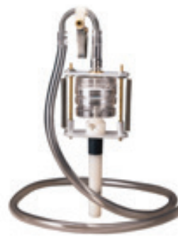
10 mm nylon cyclone is used in NIOSH & OSHA sampling methods.

The traditional personal air sampling cyclone in the US is the Dorr-Oliver, 10mm nylon cyclone. It was first utilized in US coal mines in the early 1960's, and it continues to be the most commonly used model in the US. It will follow the US ACGIH size distribution curve (50% cut at 4 microns) closely when used at 1.7 LPM. This cyclone is specified in numerous NIOSH and OSHA Test Methods for use with 37mm, 5 micron, PVC, 3-piece filter cassettes. The GilAir Plus and Gilian 5000 pump models are recommended for use with this cyclone. Calibration jar P/N 7013376 (2 Liter size) is also recommended.