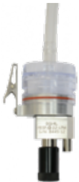
HD style cyclone with US style cassette is specified in numerous NIOSH protocols

The Gilian BGI-4L is a Higgins-Dewell style aluminum cyclone that operates at 2.2 LPM to produce a 50% cut at 4 microns per the US-ACGIH size distribution curve. This style cyclone is specified in NIOSH 0600 and other respirable dust methods as an alternative to the 10 mm nylon cyclone. It is used with 37 mm, 5 micron, PVC, 3-piece NIOSH-style filter cassettes. The GilAir Plus and Gilian 5000 pump models are recommended.