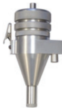
RASCAL Cyclone with Optional Aluminum Filter Holder