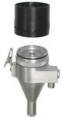
RASCAL Cyclone with standard plastic filter holder

The Gilian RASCAL (Respirable Air Sampling Cyclone, Aluminum, Large), made in the US, follows the ACGIH particle size distribution curve (50% at 4µm) at flow rates between 8.5 and 9.5 LPM, per NIOSH Report ECM/2011/03. It is ideal for use with the Gilian 12 air sampling pump for larger volume sampling per the OSHA silica standard. The high flow rate range optimizes the sensitivity for respirable dust and respirable silica dust measurements. The RASCAL is used in conjunction with a 47 mm diameter, 5 micron pore size, PVC filter membrane.