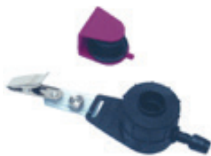
UK style Inhalable Dust Sampler with reusable 25mm cassette.

Inhalable dust sampling may be conducted at 2.0 LPM using this European style sampling head following HSE MDHS 14/3 (UK). In that sampling method glass fiber filters and MCE filters are recommended, depending upon the application. This unit incorporates a 25 mm reusable cassette.